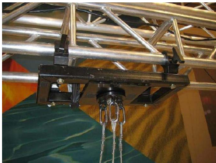
Figure 2 - Swivel Plate, pictured while attached to 12" box truss

The Passing Zone will supply the swivel mechanism. Rigging materials will be provided by the production or rigging company. Please contact Owen Morse , Technical Director for The Passing Zone (contact info on last page), to discuss the optimal approach for your venue.