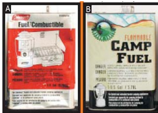
Figure 1 - Typical examples of acceptable camping fuel

(Note: If fire is not allowed in venue, the Coleman fuel is not necessary. Coleman fuel is for juggling fire, not chain saws. Purchaser does not need to provide gas for chain saws.)