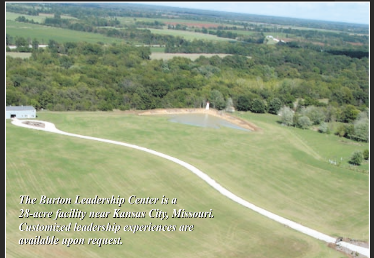
The Burton Leadership Center is a 28-acre facility near Kansas City, Missouri. Customized leadership experiences are available upon request.

Visit the Burton Leadership Center for your acceleration event or organizational retreat.