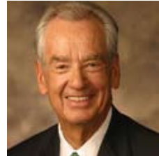
Zig Ziglar Speaker and Author