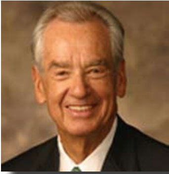
Zig Ziglar Speaker and Author